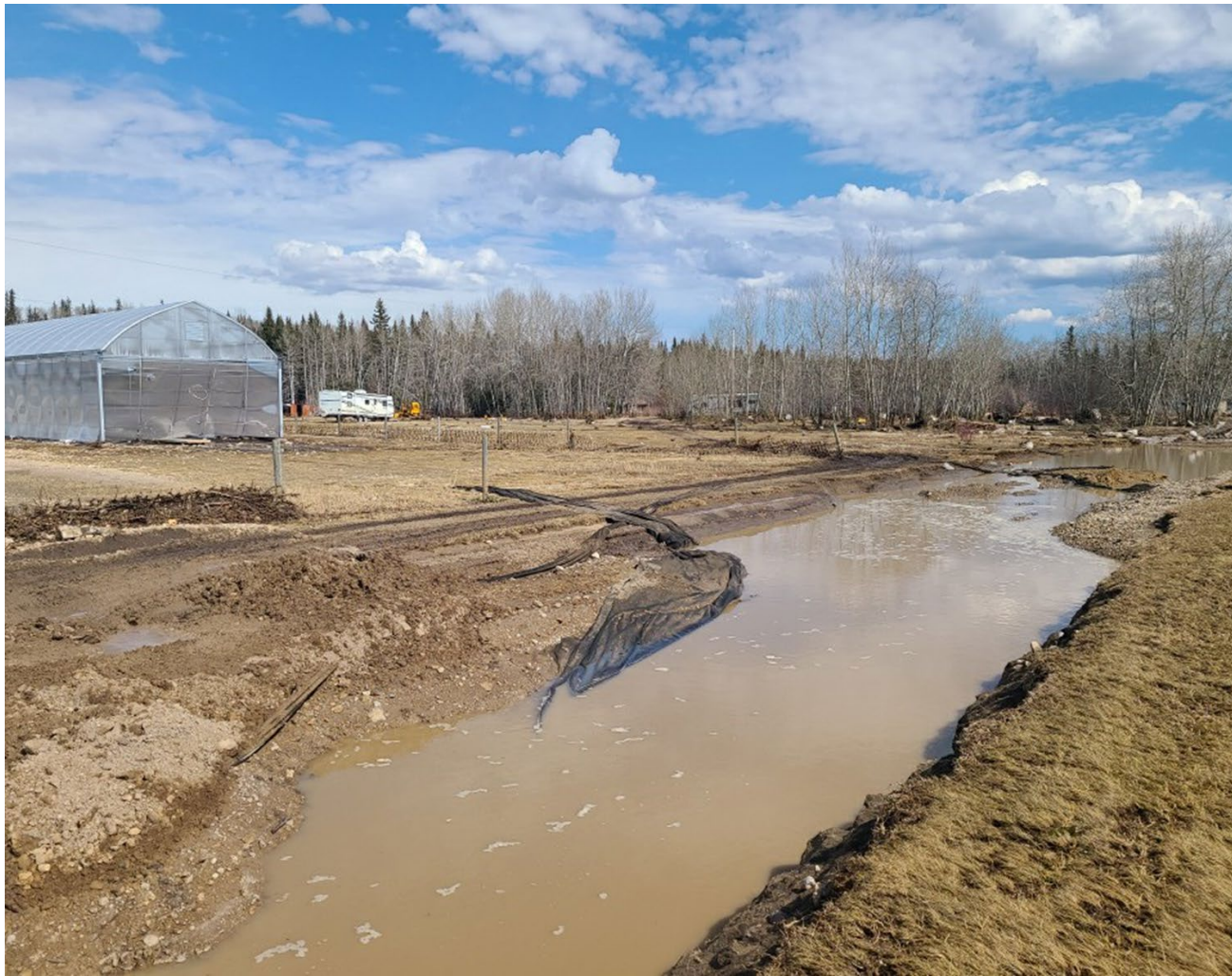
Water Treatment Plant Road & Paradise Road