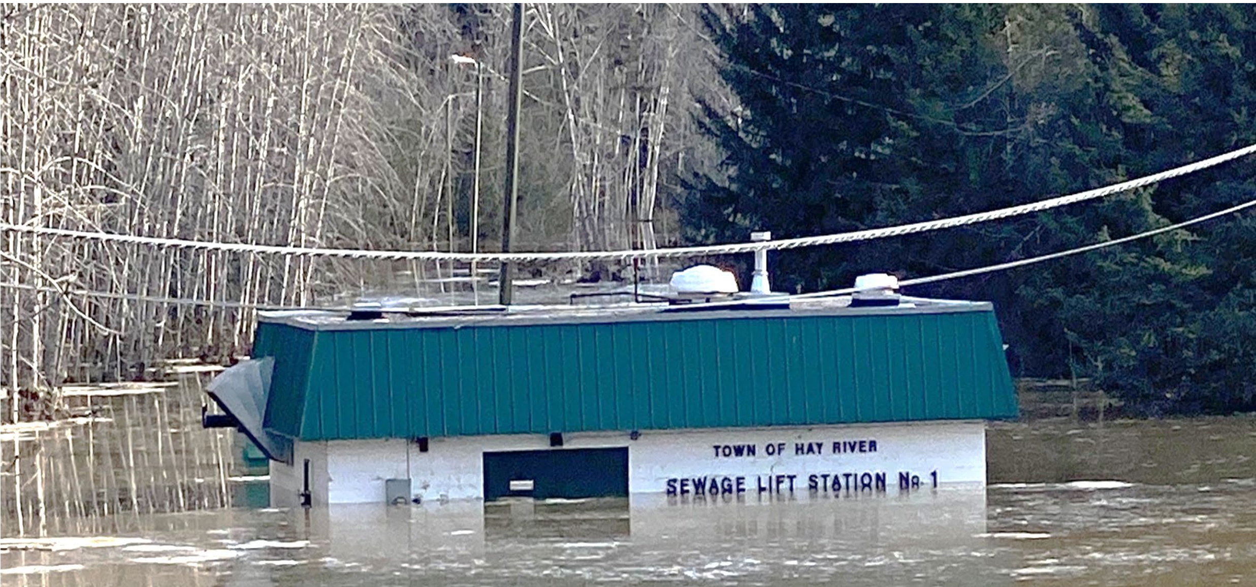
Lift Station #1