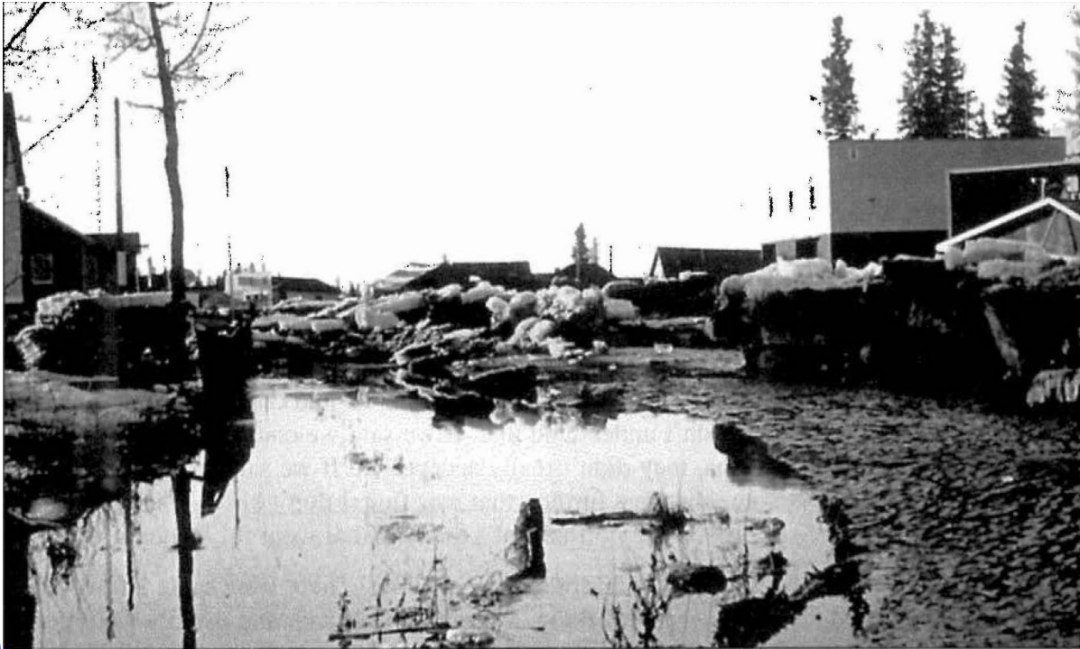
Main Street, May 1963 facing North - during Break-Up