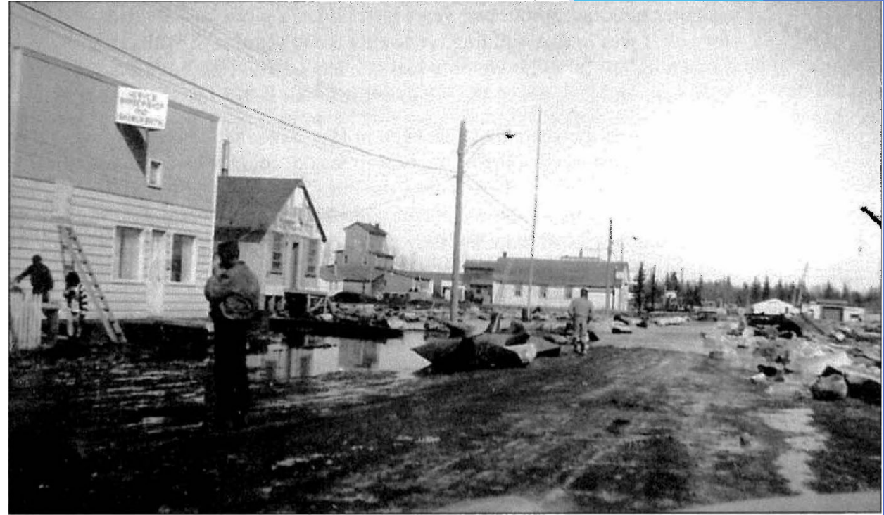
After Flood in 1963. L to R - Herve's Barber Shop & Shower Bath, Grimshaw Trucking, Tall Building, Yellowknife Transportation bunkhouse and the Pool Hall.