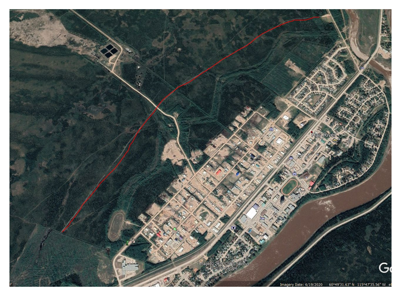
Figure 1 – Ignition Line

The ignition line project would be fully funded by ENR and would need to be completed by March 31, 2021.